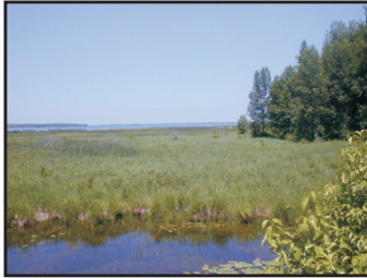
View of Sturgeon Bay

A fully paved railtrail winding its way along the southern shore of Georgian Bay from Midland to Waubauskene with a spur to Port McNicoll. Some great vistas and a walk through history with interpretive nature signs along the route. This trail is part of the Trans Canada Trail.